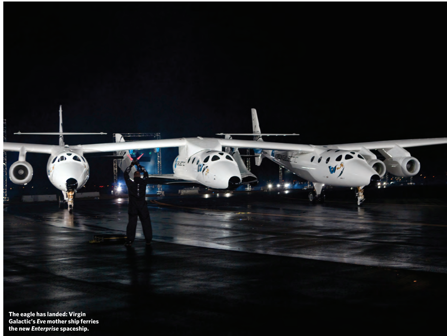
The eagle has landed: Virgin Galactic's Eve mother ship ferries the new Enterprise spaceship.