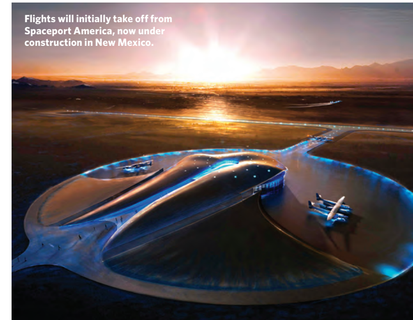
Flights will initially take off from Spaceport America, now under construction in New Mexico.

Fewer than 500 people have ever gone into space, so you'll be joining lofty ranks.