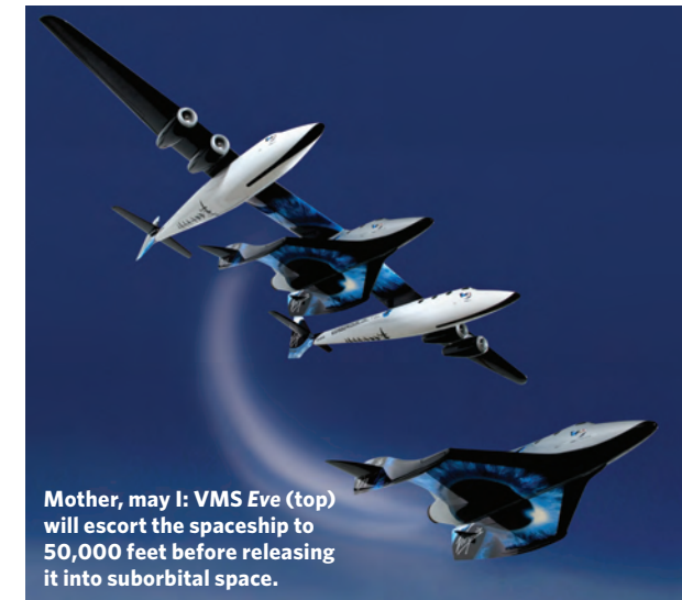
Mother, may I: VMS Eve (top) will escort the spaceship to 50,000 feet before releasing it into suborbital space.

STEP 8 Return to your seats – and an entirely new perspective. Pointing back toward Earth, the spaceship embarks on a thrilling 90-second reentry, peaking at nearly 6 gs. The spaceship's wings, which have been neatly "feathered" up throughout the flight, will rotate back to their usual position to glide you safely back to Earth to collect your astronaut wings. One thing is quite certain: You will exit that spacecraft a changed person. VI.