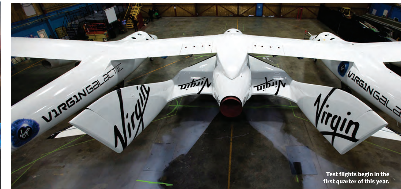
Test flights begin in the first quarter of this year.